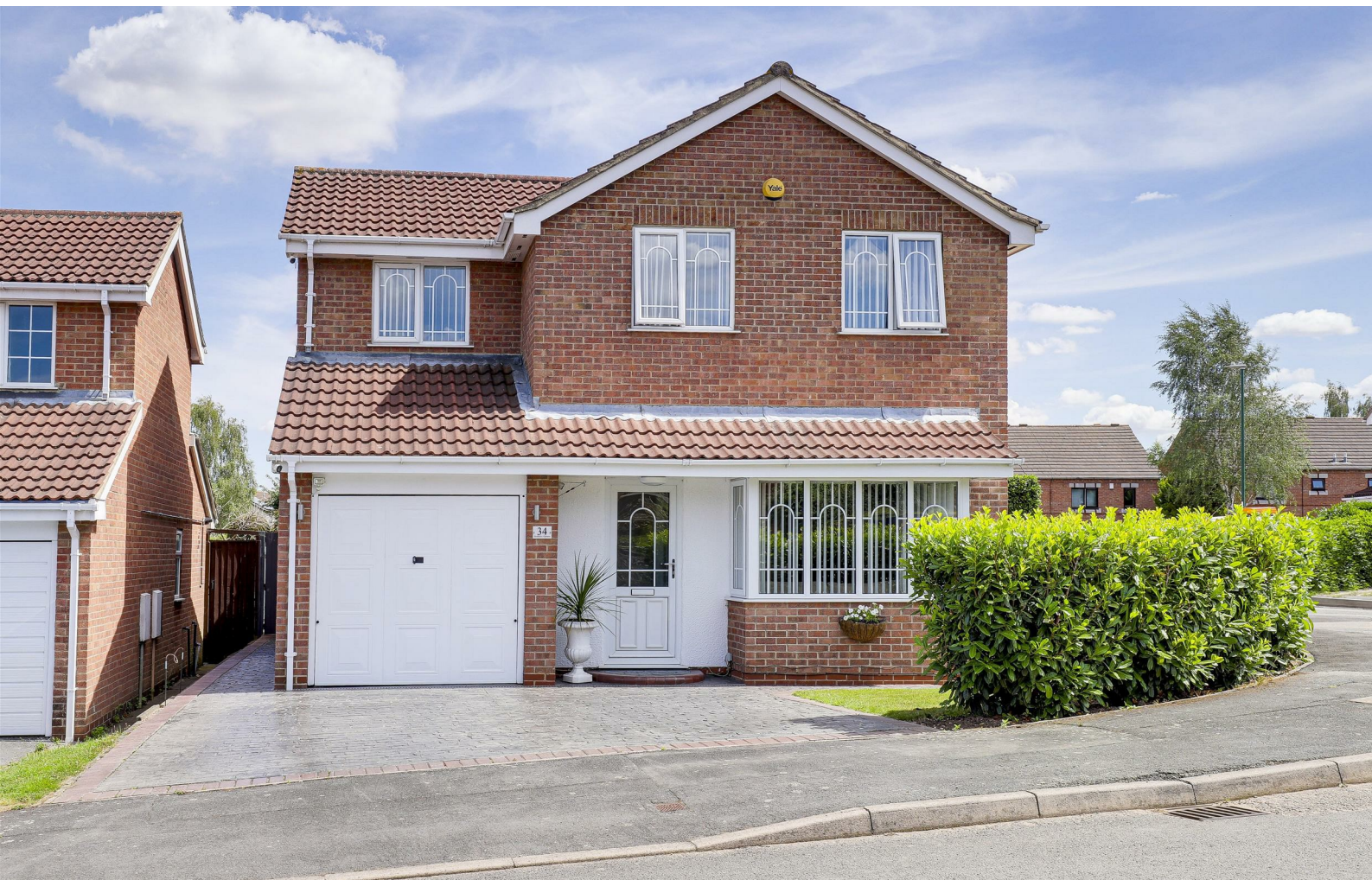
Hawksley Gardens, Clifton, Nottinghamshire NG11 8SU